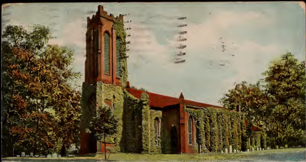
STAUNTON, Va. Trinity Church.